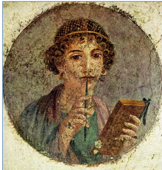
A wall painting of a young woman with a stylus & notebook from Pompeii, Italy, 1 st century CE.

This schedule is subject to change at any time.