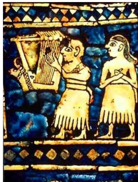
Image of a lyre player and a singer from the Standard of Ur, 2600-2400 BCE.